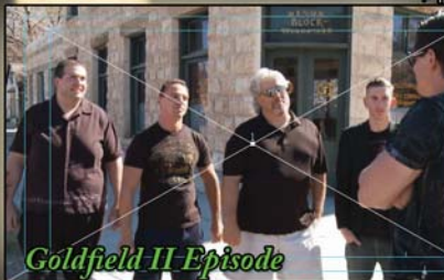
Goldfield II Episode

GTOPS seen here with Ghost Adventures Crew